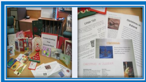
Christmas Greetings from around Europe